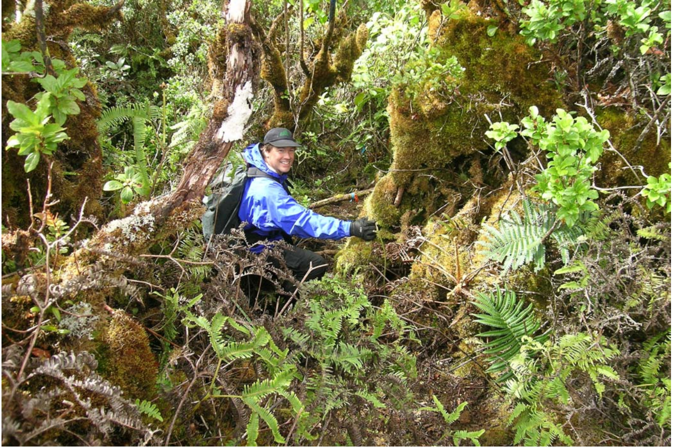
An “easy” spot on the Purgatory section.