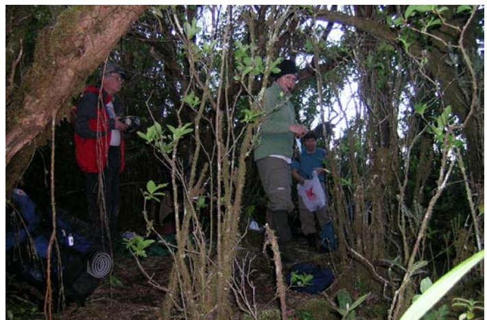
“Desperation Camp” between Arrow and Sincoc’s bog.