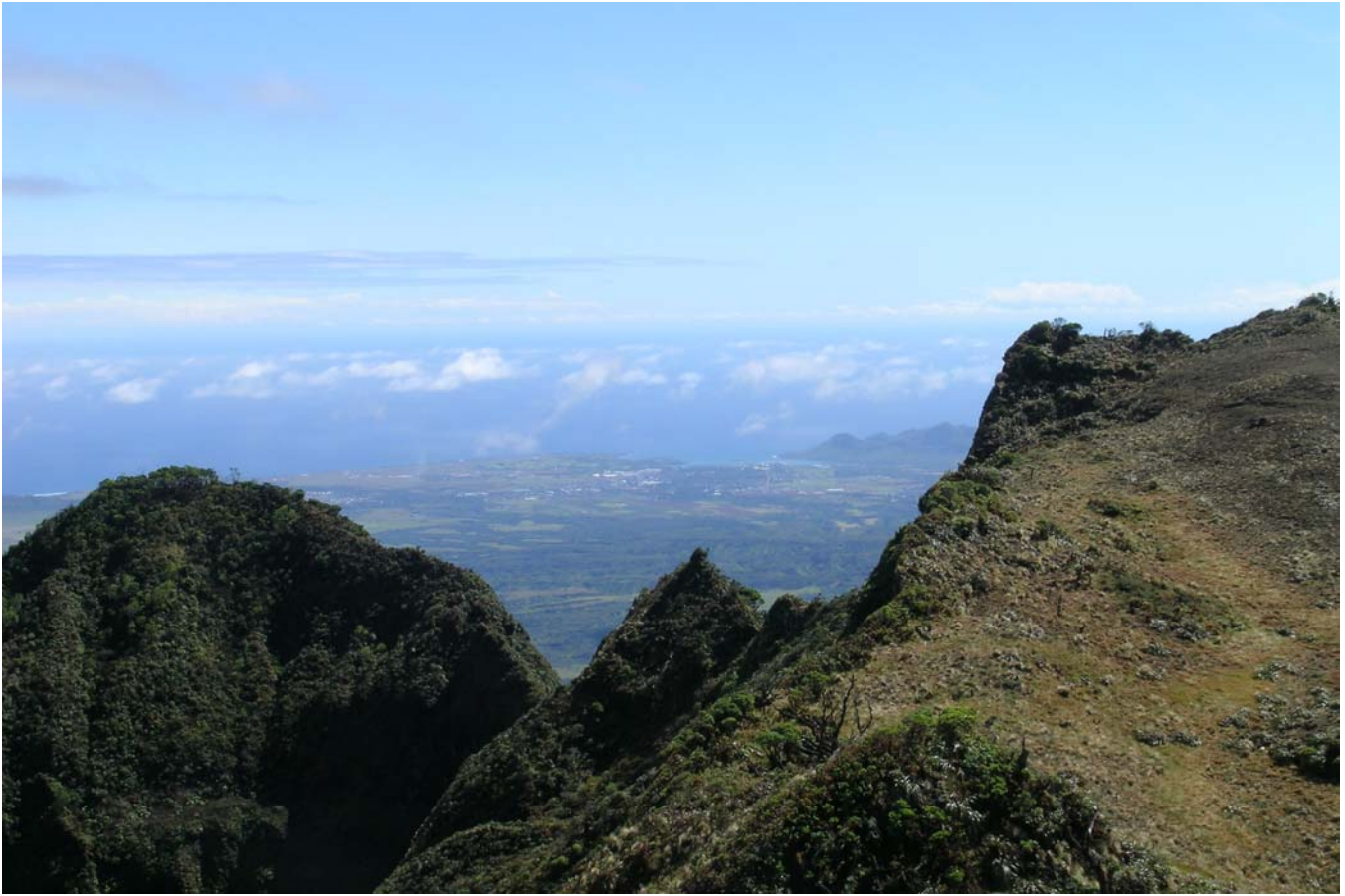
Lihue from the summit.