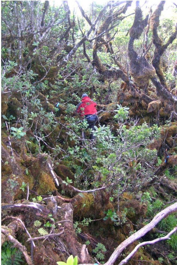
Bob attacking the Purgatory tangle. This is a flagged route!

We arrived at a good camping spot on the east side of the crater floor a little after 5pm, and I set out to find the flagged route while the team made camp. It had taken us an incredible 8 hours, 19 minutes to fight our way over only 1.05 miles straight line distance. This turns out to be only 670 feet/hour! I found the flagged route just a few hundred feet south of our campsite and followed it 6/10 mile to the headwall of a box canyon that led to the ridge. Satisfied that we now had a chance at victory, I made my way back to camp and literally crashed for the night.