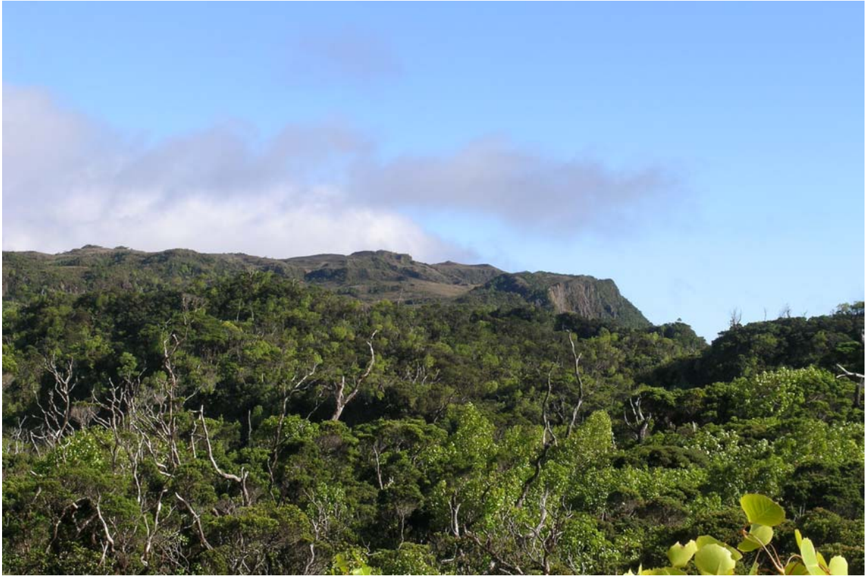
The summit is slightly left of center in this photo taken from the east rim of Kapoki Crater.