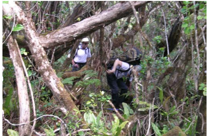
The easy part was soon over!

From the trailhead, those first couple miles were relatively easy going and it's evident that some effort is made at maintenance in this section leading to the USGS rain gauge at approximately mile 2. However, the picnic ends there and the way is