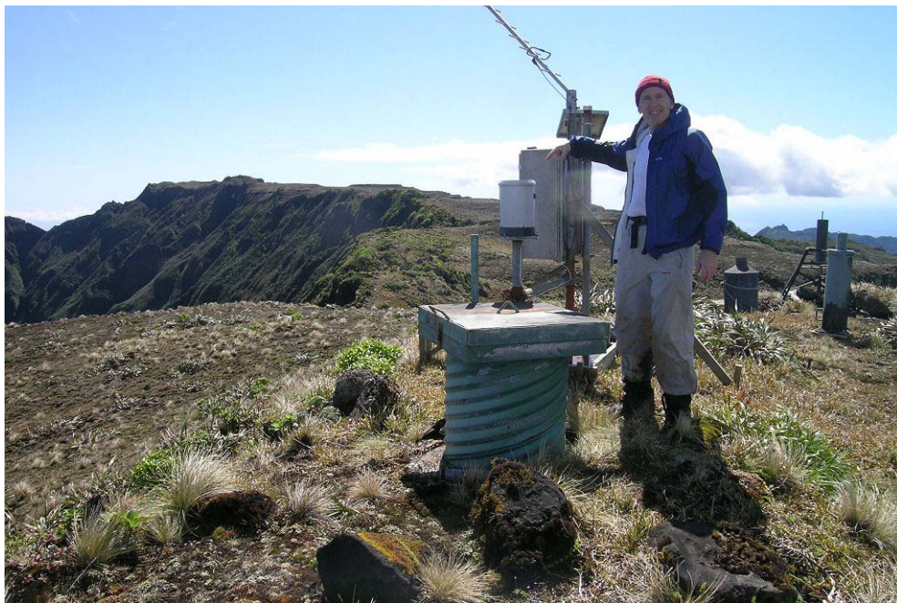
Waialeale rain gauge. Kawaikini summit in the distance.