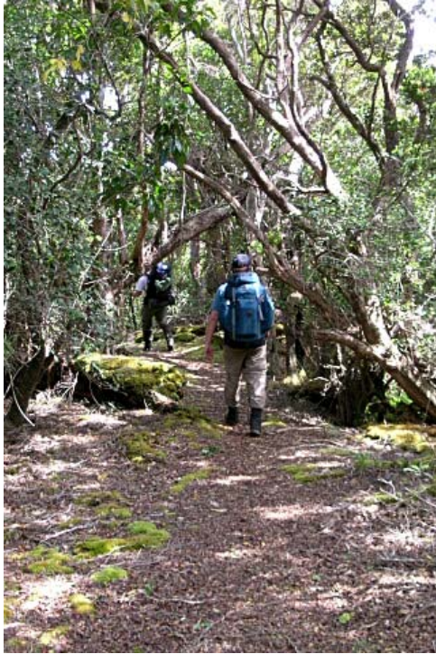
Dave and John on the first two miles of the trail

After a leisurely breakfast at Burger King (!), we drove up Waimea Canyon with quiet confidence and made our way along the muddy and rutted 6-mile dirt road to the trailhead at Camp 10. We started on the trail at 10:33am. With a four-man team and heavy packs, the going was much slower than I had expected, which resulted in our running out of daylight and having to camp in a less than desirable spot (“Desperation Camp”) far short of our intended goal. Nevertheless, we made do, slept comfortably under a full moon lit sky, and hit the trail at 7:49am the next morning.