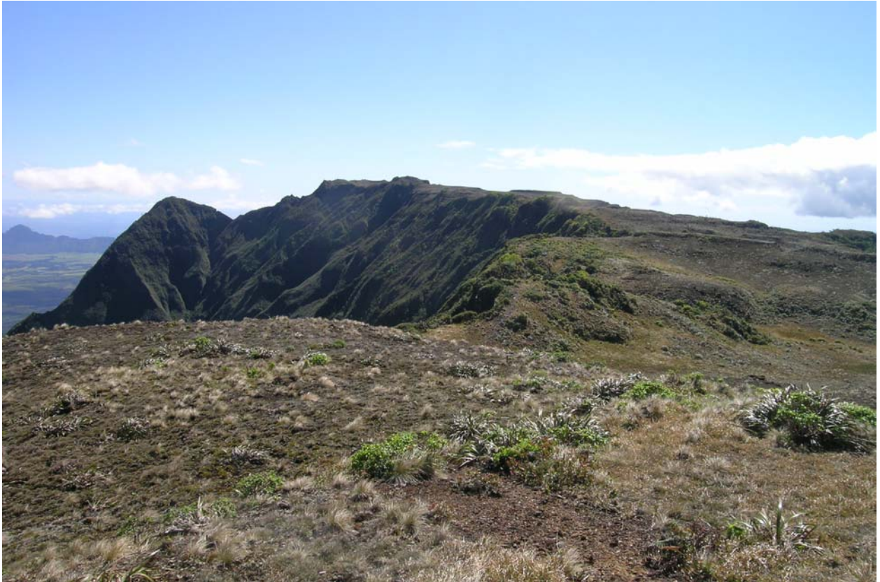
The view south towards the summit from the rain gauge.