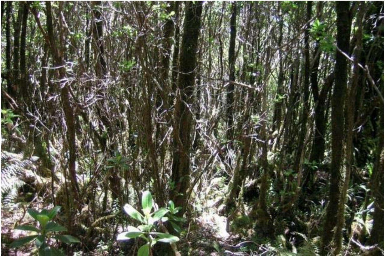
Typical view of the area east of Boggette and the start of Purgatory. Not impenetrable, but close to it!

The section of "trail" east of the bogs they aptly named "Purgatory" and I took their names in vain more than once as we laboriously beat ourselves up making less than 700 feet/hour forward progress! Our navigator, yours truly, had failed to fully grasp the meaning of the difficulty of this route but finally we found our way into Kapoki Crater and knew we had to be very close to the described blue flagged bird transect route that would lead us out of the crater and up and onto the final ridge.