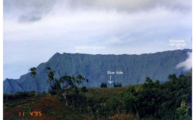
Photo taken on 11/95 trip