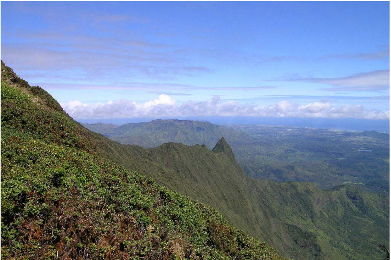
Edge of the abyss and ridge used by the Ancients

One doesn't really “conquer” Kawaikini. The ancient gods of Hawaii allow you to briefly trespass there. (Lono: the Hawaiian god of peace, prosperity, wind and rain .) If you are lucky, you will return alive, if chastened, to the realm of soft breezes and beautiful tropical climes. Thus, arriving at the highest point of the island and county of Kauai, Hawaii, has long been the “holy grail” of county highpointing and for very good reasons. The highpoint, 5,243 foot Kawaikini, is guarded on its west side by miles of dense, swampy forest and on its north, east and south by near-vertical cliffs. From the time of the ancient Hawaiians down to present day, the lore surrounding access through the fabled Alakai Swamp has awed all who would consider venturing there, and the reality of its conditions has repelled almost all who have tried. The only other approach is up the great ridge from the northeast, which was used by the Ancients to visit their Heiau (near the small summit lake Waialeale: “Rippling waters”), had its last documented ascent circa 1902, and has been long lost to the jungle and rockslides.