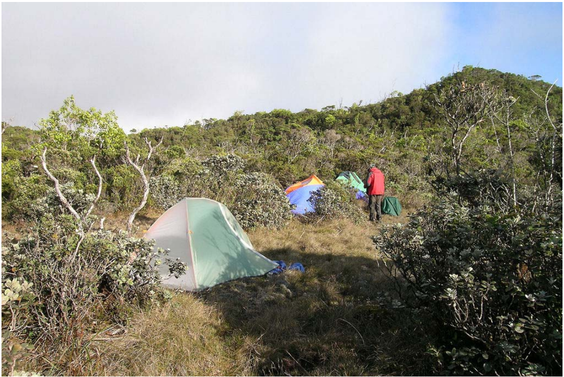
Kapoki Crater Camp

Morning dawned gray, rainy and dreary and our spirits were not the best. We were at the critical point in the journey: Could we get to the summit and back to our camp by nightfall? What would happen if we ran out of daylight in the canyons just west of our camp on our way back? My recon told us that this was a particularly tough section of “trail” so it was imperative we get back over it before dark. After much discussion and some indecision on my part, the team coalesced, decided on turnaround times, and all resolved to give this summit one hearty attempt.