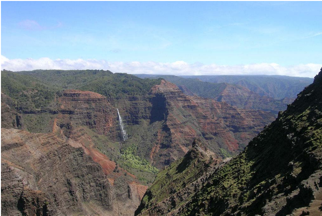
Looking towards the summit across Waimea Canyon on the drive up hwy 550.