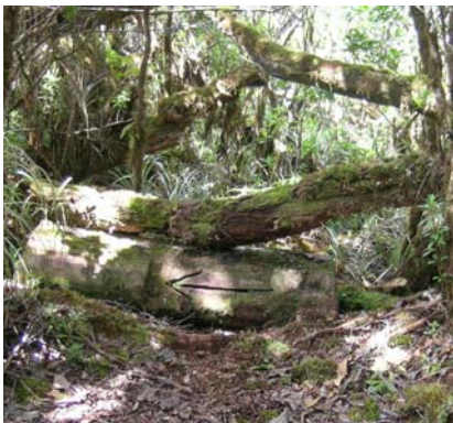
“Arrow” at mile six.

increasingly difficult and harder to follow, with increasingly severe impediments to travel including mud holes, downed trees, and numerous steep and brushy sections.