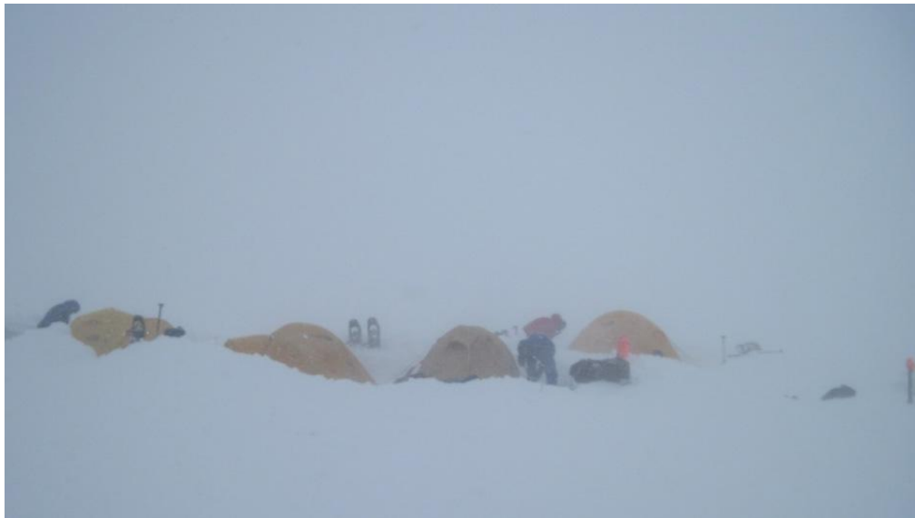
of High Camp in blizzard

The snow and wind continued all night and created drifting mounds everywhere including in the tent vestibule and between the fly and the tent body fabric, even into my boots. We shoveled the drifted snow from around the tents and snow block walls. The blizzard continued all day as we read books and played games between snow shoveling every few hours. It was a complete white out all day and we heard falling seracs. We now were worried about avalanche danger. The drifting snow filled in the latrine; we put out wands to the toilet area to find our way back to the tent.