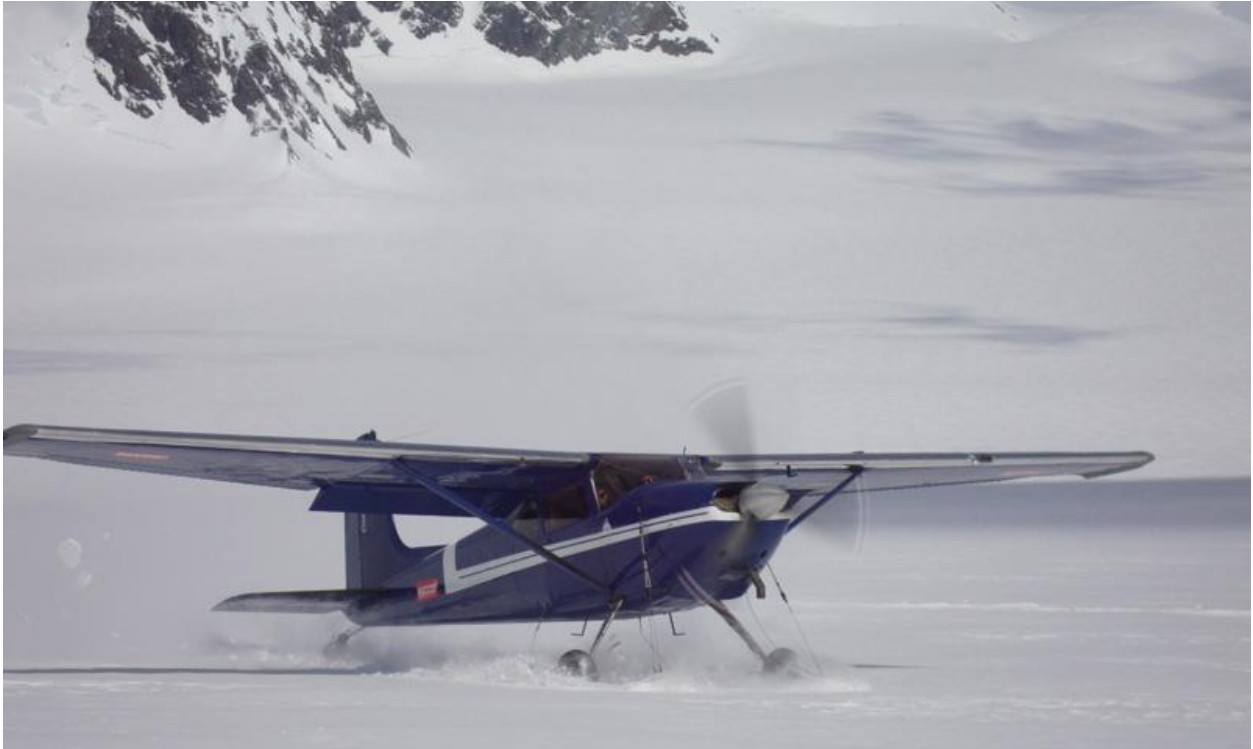
Drake Olson landing on the Glacier

Drake, the pilot was due to pick us up at Base Camp at 10:00 am. We were up early to pack up camp and head down. We also had to pack up the Base Camp tent. We told the guided team the mountain conditions and what they would find up there. Jim and I were the first 2 to fly out. Drake was able to fly all 7 of us back to Haines in 3 flights. We were all back to Haines by mid-afternoon. That evening we had a 4 ½ hour celebration dinner at Halsingland House.