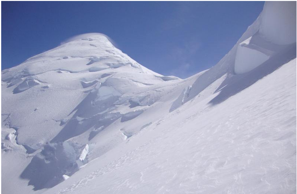
of Fairweather below saddle ridge