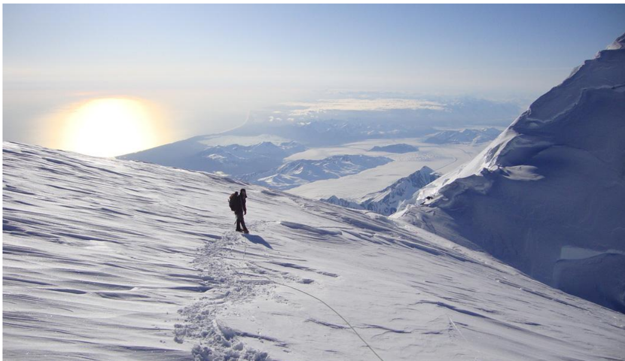
Wayne on Fairweather ridge with Glacier Bay in distance

We moved quickly down but stopped to photograph the sun reflecting off the Bay. Jim spotted us on the ridge from the Mezzanine Camp and gave us a radio call. We discussed pulling the fixed ropes but decided to leave them for the guided team. We got back to camp at 8:10 pm., less than 12 hours after leaving for the climb. Many of the team was out to welcome us after our success.