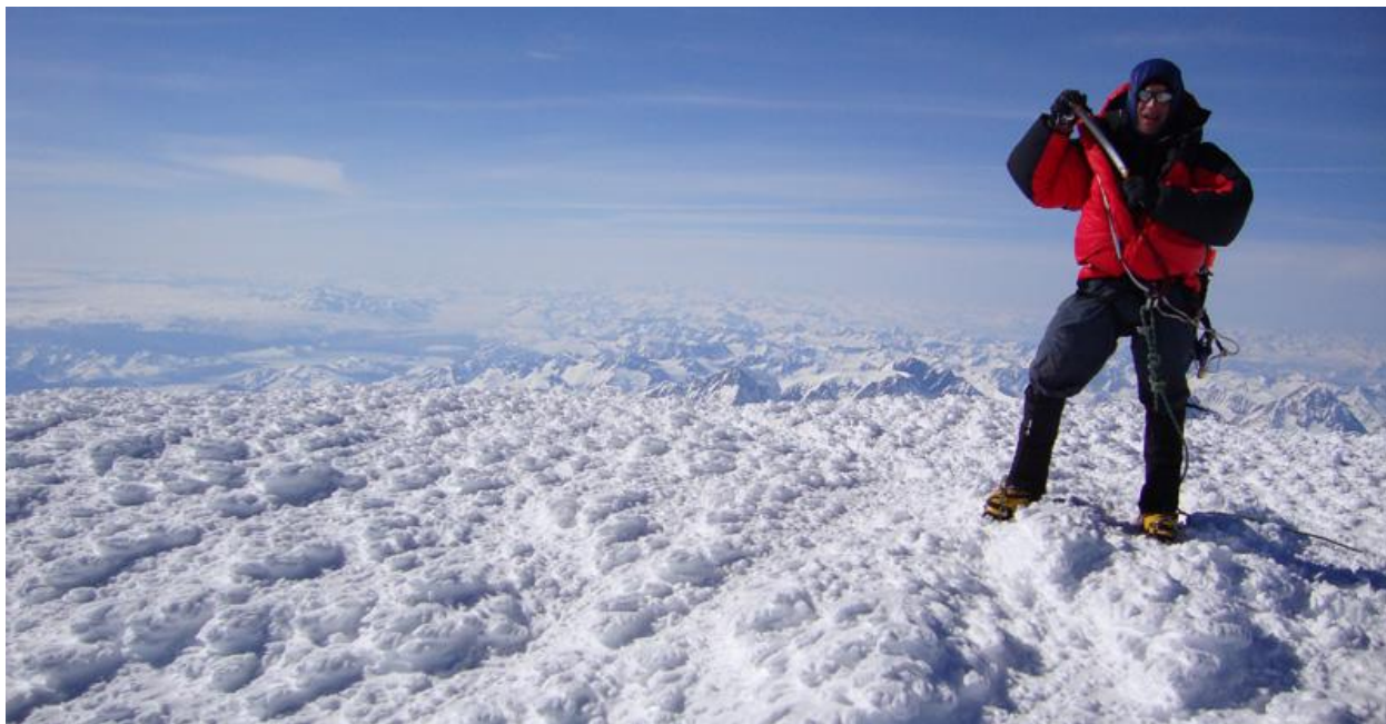
Wayne on Fairweather summit

We moved quickly down but stopped to photograph the sun reflecting off the Bay. Jim spotted us on the ridge from the Mezzanine Camp and gave us a radio call. We discussed pulling the fixed ropes but decided to leave them for the guided team. We got back to camp at 8:10 pm., less than 12 hours after leaving for the climb. Many of the team was out to welcome us after our success.